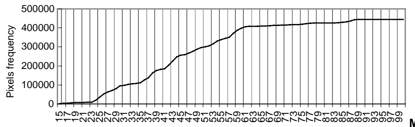
Fig.1. The cumulative curve of pixels frequencies of lanslides hazard zonation map in AHP method

cumulative curve between pixels frequency and M values, has been drawn (Figure 1).