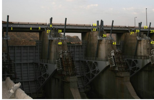
Figure 3: Ground control points on spillover

Before measure target coordinates on spillover in order to introduce to the software as control points to unify both coordinate system and evaluate the accuracy and precision of entire measurement, creating of geodetic network around the spillover to determine any movement between to epoch on geodetic stations, is necessary. Therefore coordinate of some targets (figure 3), were computed by intersection, horizon and vertical angles were observed by motorize total station “Trimble 5602 (2" accuracy) with 5 acceptable couples. For further computations, entire images beside all computed coordinates introduced to Australis software.