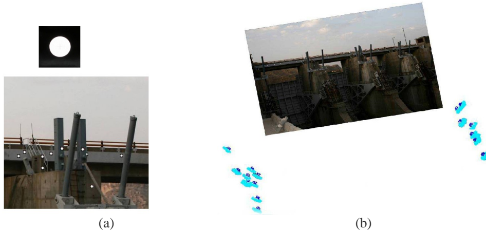
Figure 2: (a) Targets on spillover, (b) Photogrammetric network design view

Finally by noticing the following comments (network design and camera configuration) and limitations such as mountainous environment and difficult work space conditions, total 110 images from 22 stations (5 image per station) have taken from both side of the spillover (figure 2.b).