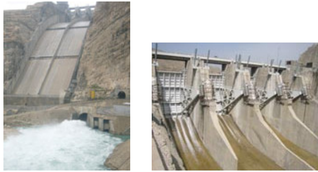
Figure 1: spillover of Marun dam

So the aim of this research can summarize in evaluation of capability of photogrammetry in 3D measurements on dams. For this reason spillover (245.7 by 62.8 m) of Marun dam (figure 1) has selected as case study, and for accurate measurement a digital high resolution camera “Canon EOS 30D” (pixel size: 6.4 \mu\text{m} ) has employed. To reach maximum accuracy, retro-reflective targets including environmental situation, and motorize total station for reading number of targets (control points) were involved. All the computations and processing were done by “Australis” software.